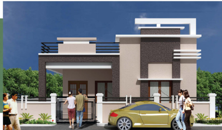
WEST FACING HOUSE

VASUNDHARA FORTUNE HOMES is a new victorious and moonscape venture from Vasundhara Projects is located on Visakhapatnam - Atchuthapuram. The project is spread over 50 acres of land, The project hosts a variety of well grown fruit bearing trees. It is an ideal place for comfort and peaceful living. The serene atmosphere and pollution free air will rejuvenate you all. It is a right value for your investment, because it is a place for blissful living.