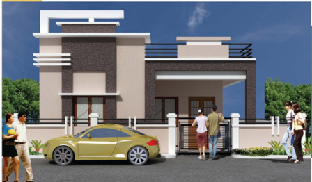
EAST FACING HOUSE